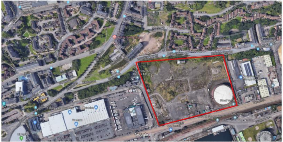
nagery 62018 Google, Map data 62018 Google 55 m